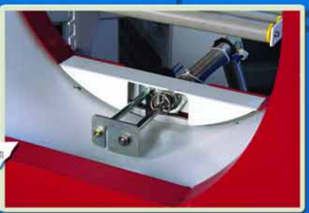
Gruppo pinza e taglio • Clamp and cut of the film