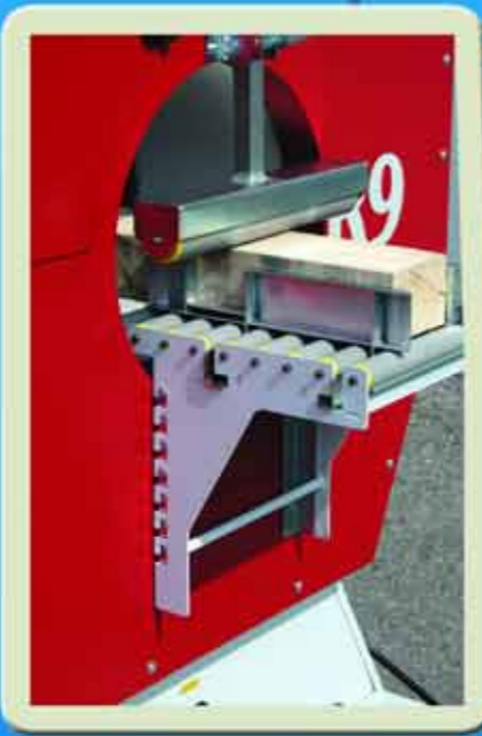
Rulliera Regolabile • Adjustable Conveyor