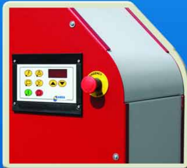
Pannello di Controllo • Control Panel